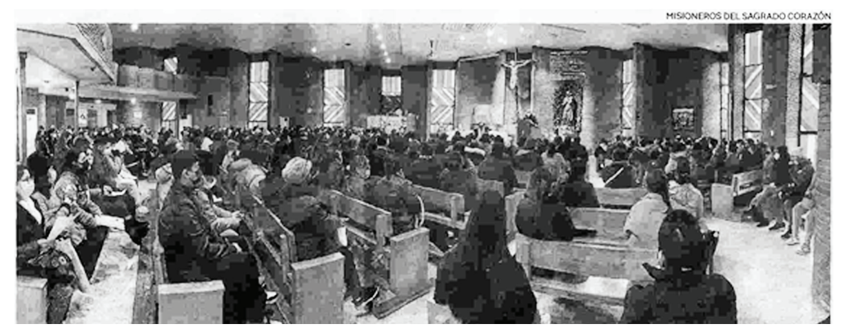
The provincial of the Missionaries of the Sacred Heart, in charge of the parish, is in charge of the welcome.

The Parish of Our Lady of the Sacred Heart welcomes more and more people looking for job opportunities. Since the project began more than 20 years ago, they have facilitated more than eighty thousand people in finding jobs.