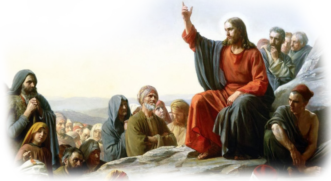
"Il Discorso della Montagna" di Carl Heinrich Bloch

On the mountain, Christ gives the disciples a new law written in the heart, no longer on stone, that renews our lives and makes them good, even when the world seems to have failed us and is full of misery. Jesus announces Good News for all humanity.