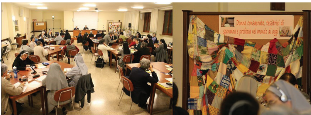
ROME CONSTELLATION MEETING