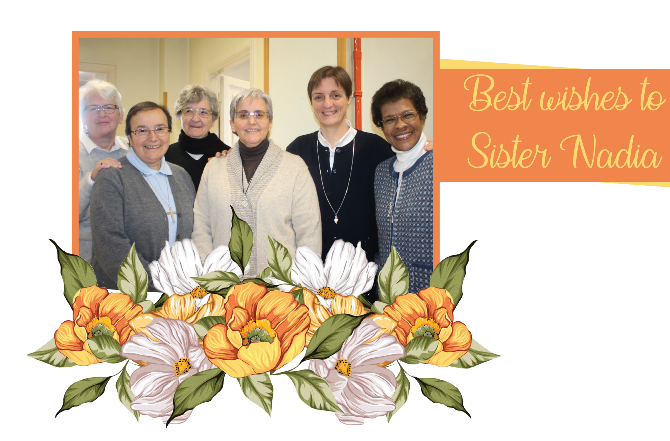
ROME CONSTELLATION MEETING